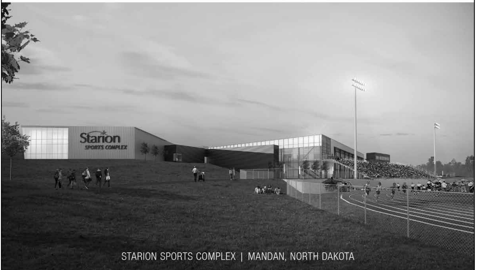
STARION SPORTS COMPLEX | MANDAN, NORTH DAKOTA