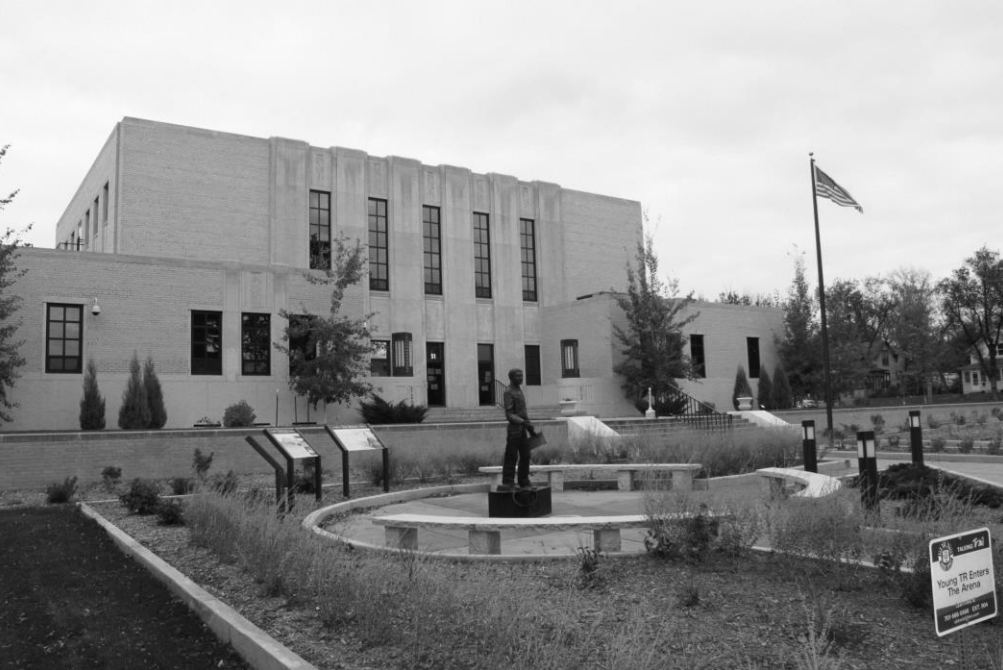
Stark County Courthouse, Dickinson