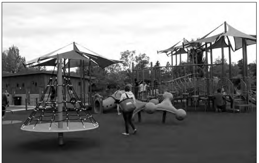
Friendship Park in Dickinson